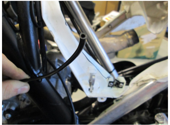
9. Boost line routes with boost solenoid adaptor and hooks into the "push to connect" on the intercooler.