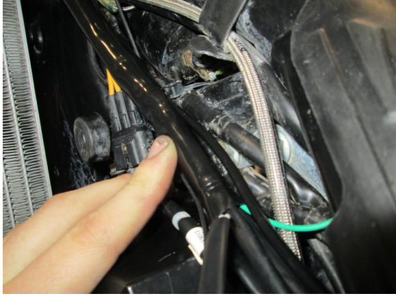
1. Route harness through handlebars and along stock wire harness. Mount control box to the handle bars.