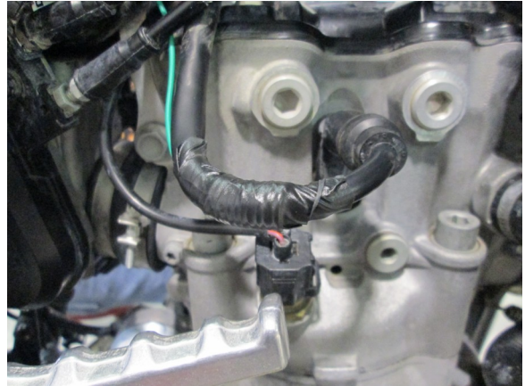
7. Wrap green wire & wrap tightly with electrical tape.