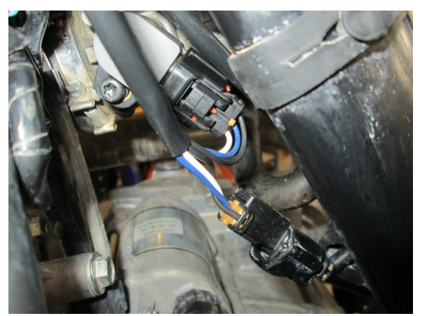
5. Install Boondocker TPS harness between the Throttle Position Sensor and the factory harness.