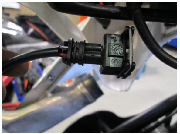
3. The Wastegate solenoid connector plugs into the boost solenoid and has a Violet/white and Red wire.