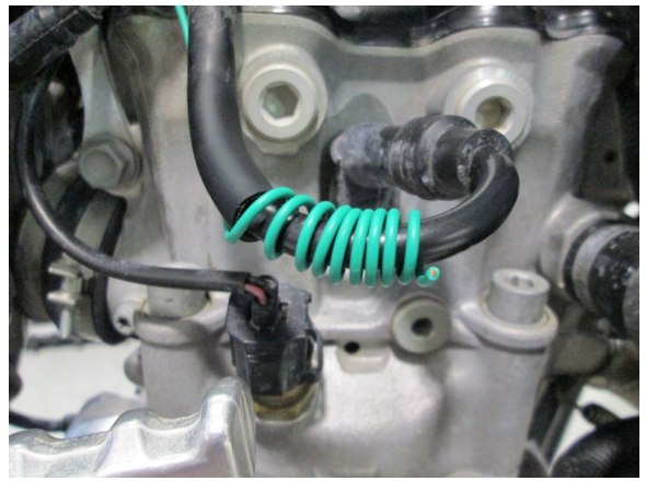
6. Route green wire above stock wire harness under the frame to the spark plug wire. Wrap around 10 times. Cut off excess wire.