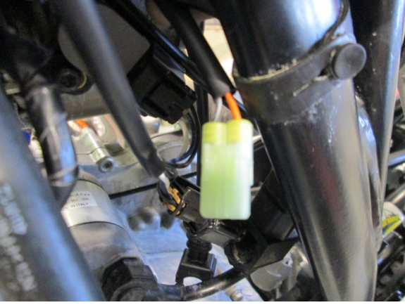
2. Air temp adaptor plugs to the intercooler mounted air temp sensor