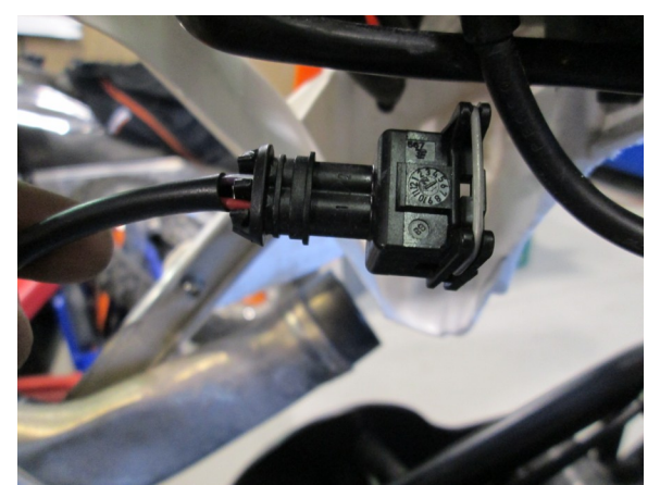
10. The Auxiliary injector connector is similar to the solenoid connector. It is shorter and has a Violet and Red wire.