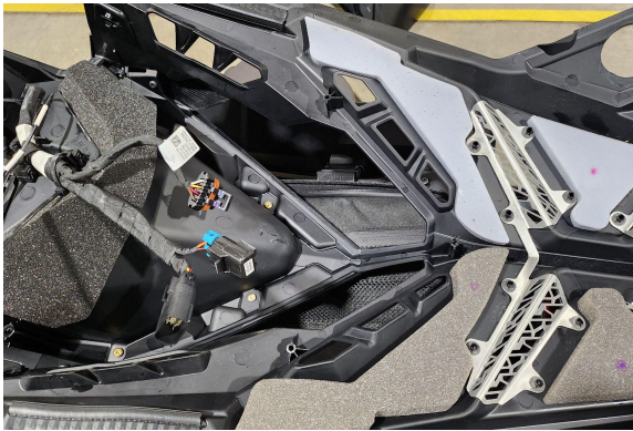
4. Remove the headlight from the hood.