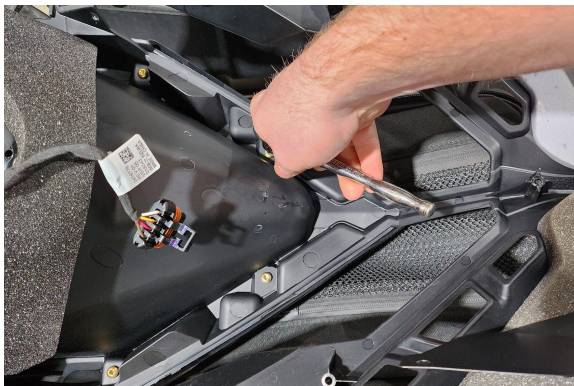
5. Using a t 25 torques remove both left and right ear plastics located at the back of the headlight hole.