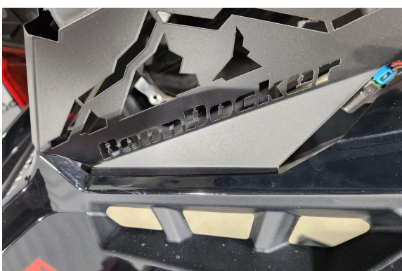
7. Starting on the left side of the hood, Bolt the previously removed ear to the hood mounting the De-Lite between the ear and the hood.

Note: the De-Lite should slide just under the top storage box edge.