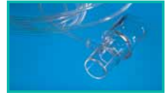
Airway Adapter Sampling Line

Available in Adult and Paediatric sizes & also available with O 2 delivery