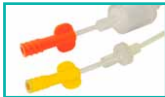
Oridion Nellcor, Covidien, Medtronic