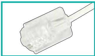
Luer Lock Male