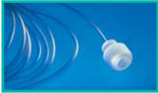
Nasal Sampling Line