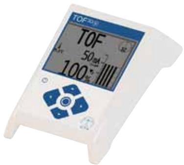
TOF 3D Neuromuscular Transmission Monitor Part No.: 2510091

5750109 2530121 Sealing Covers (Pack of 3) For Data Interface Socket. One Sealing Cover included with 2510091.