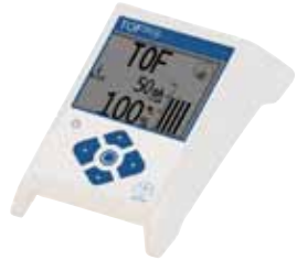
TOF 3D Neuromuscular Transmission Monitor Part No.: 2510091