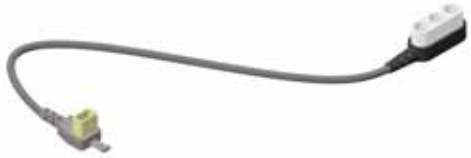
REF Part No. Description 5750108 2510102 Main Patient Cable* Overall assembly length: 262.5 cm, cable length 250cm