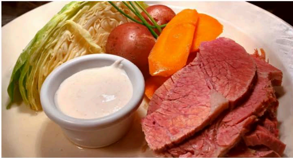
Rose McCann's serves its corned beef with red potatoes, carrots, cabbage and a side of creamy horseradish.

By LINDA ZAVORAL | lzavoral@bayareanewsgroup.com | Bay Area News Group