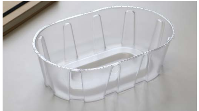
PETG Food container made with the Mayku Multiplier.