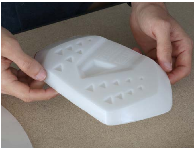
Motorcycle vest prototype made from UHMW.