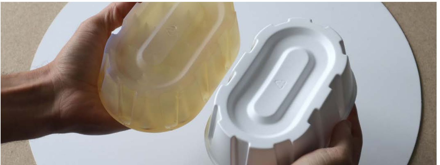
HIPS prototype of food container next to 3D printed template used to create the form.