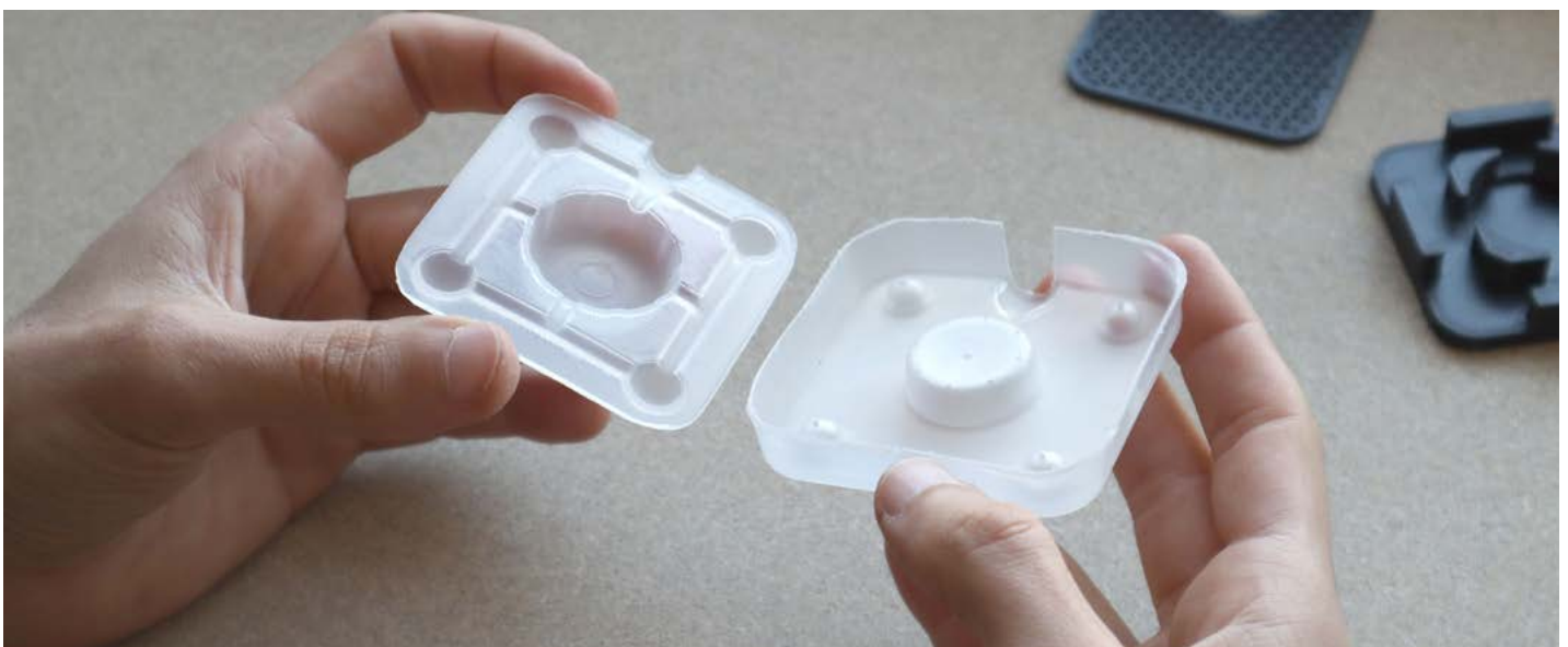
Both elements of a 2-part mold used to create a button.