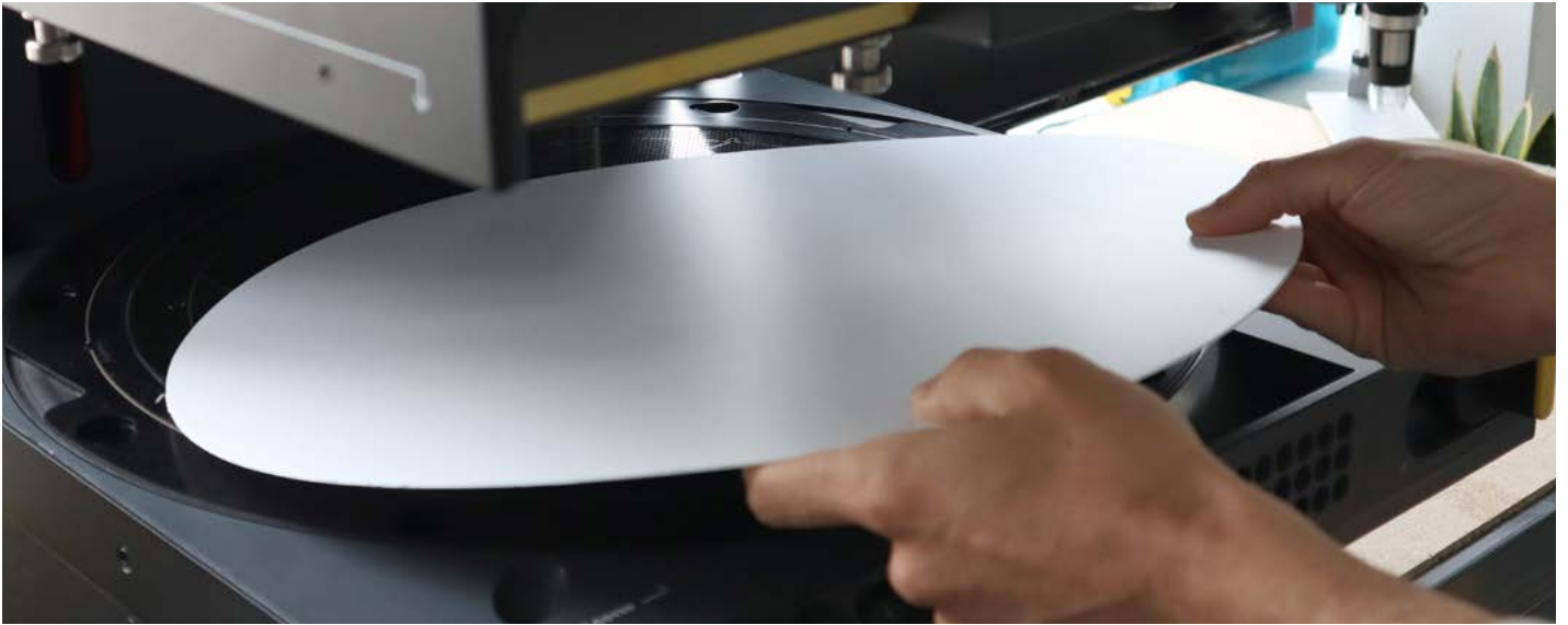
HIPS sheet being inserted into the Mayku Multiplier.

HIPS is known for its high strength, rigidity, and dimensional stability. It has excellent electrical properties and is resistant to many chemicals. HIPS is also relatively inexpensive compared to other thermoplastics, which makes it a popular choice for a wide range of applications.