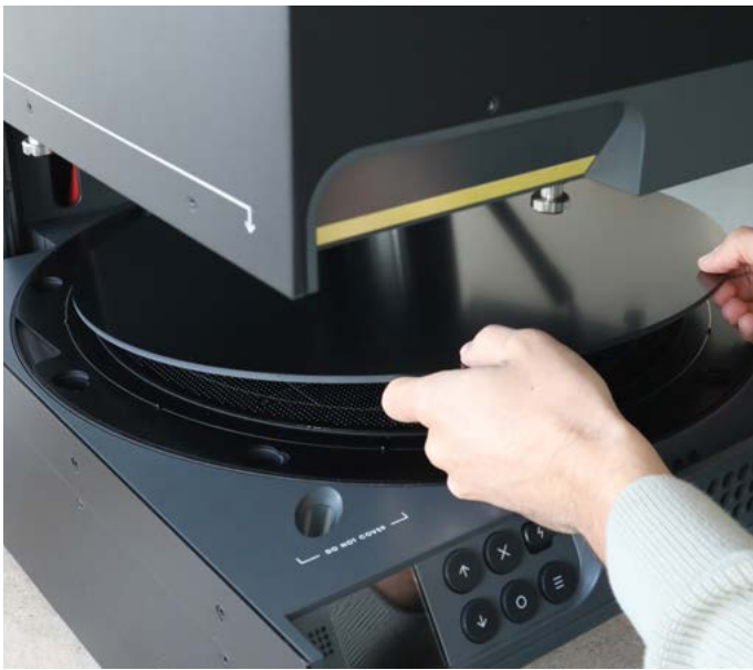
ABS sheet inserted into the Mayku Multiplier.

ABS (Acrylonitrile Butadiene Styrene) is a thermoplastic polymer that is commonly used in the manufacturing industry. It is a strong, durable, and lightweight material that is resistant to impact, heat, and chemicals. ABS is a popular material for producing consumer products such as toys, automotive parts, electronic housings, and kitchen appliances.