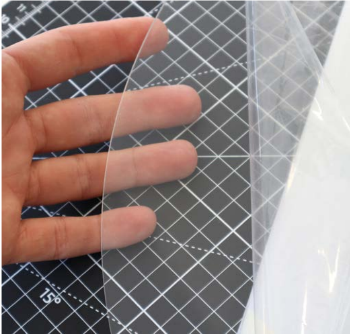
PMMA sheets are optically clear.

PMMA, also known as Polymethyl methacrylate and often referred to as acrylic, is a transparent thermoplastic that is widely used as a lightweight and shatter-resistant alternative to glass. It is a versatile material that has a variety of applications due to its transparency, durability, and weather resistance.