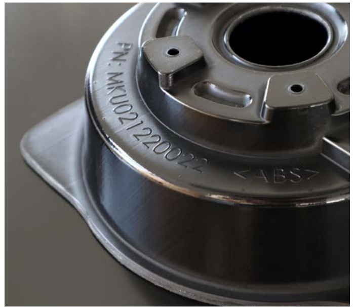
Automotive prototype part made on the Mayku Multiplier.