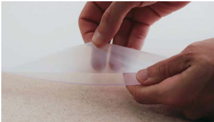
Protective film being removed from PETG sheet.

One of the major benefits of PETG is its environmental friendliness and ease of recycling. PETG is also FDA-approved for food contact, making it safe for use in food packaging and medical applications.