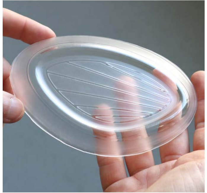
Car light lens made on the Mayku Multiplier.