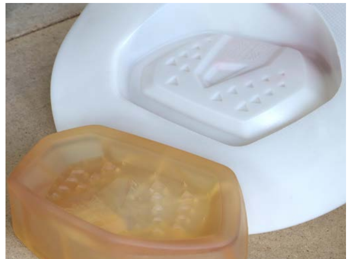
Template de-molded from a formed UHMW sheet.