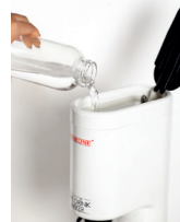
Fig - 1