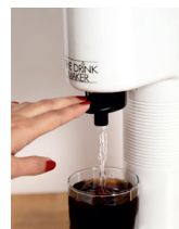
Fig - 3