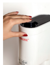
Fig - 2