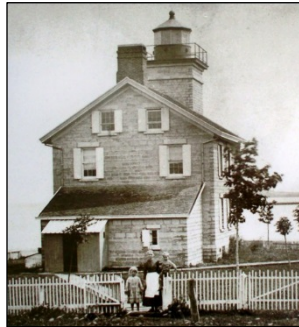
1871 Lighthouse (Photo from 1880s)

The Sodus Bay Historical Society actively promotes local history for the enjoyment of area residents and visitors and preserves local history to ensure future generations benefit from the knowledge of the past.