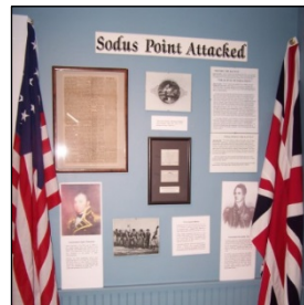
War of 1812

We provide educational forums such as school tours, lectures, and our popular "History Alive!" events.