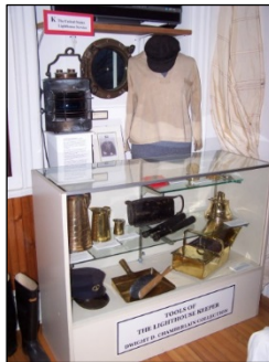
Tools of the Lighthouse Keeper

We operate the Sodus Bay Lighthouse Museum and have built our collection over the last 35 years. Our acquisitions focus on maritime artifacts and artifacts depicting the history of the Sodus Bay area.