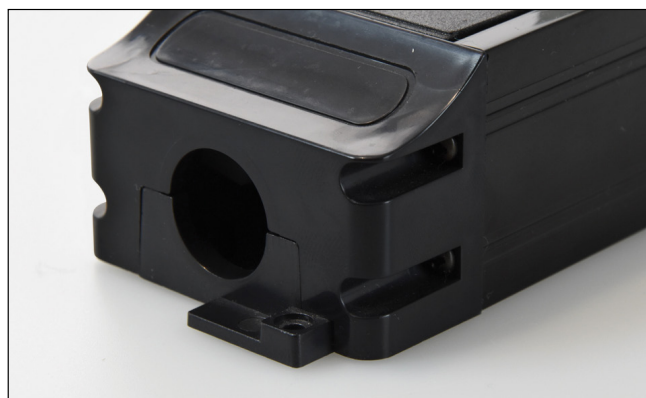
20mm Gland hole with connecting block