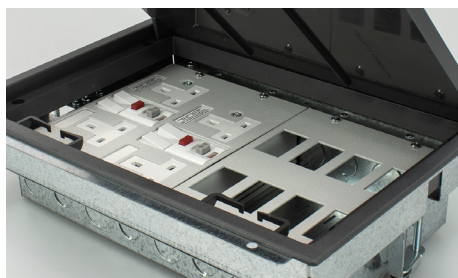
Model: TFB4/80-RCD2 (LJ6C)

Configured with optional 2 x 4 way Data Plate STO285/2