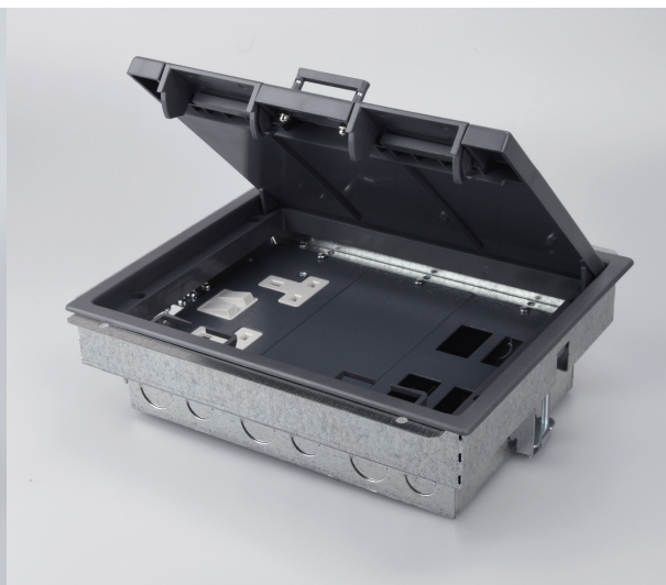
Illustration above shows TFB3s Cavity Floorbox fitted with STO300, STO301 and STO302 (plates sold separately).