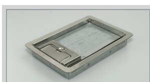
SSL12R346 12mm Recessed Stainless Steel

Contact: sales@floorbox.co.uk | Visit: www.floorbox.co.uk