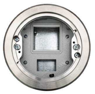
PGS102 Euro Collar Grommet (50x50mm) + 1 Data (LJ6C)