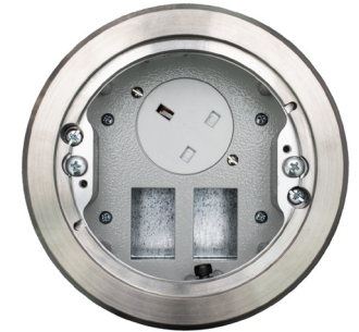
PGS003 13A Power Socket) + 2 Data (LJ6C)