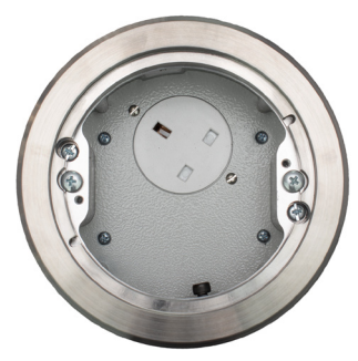
PGS001 13A Power Grommet