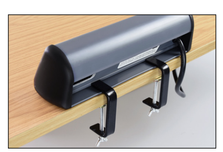
Desk Fixing Clamps