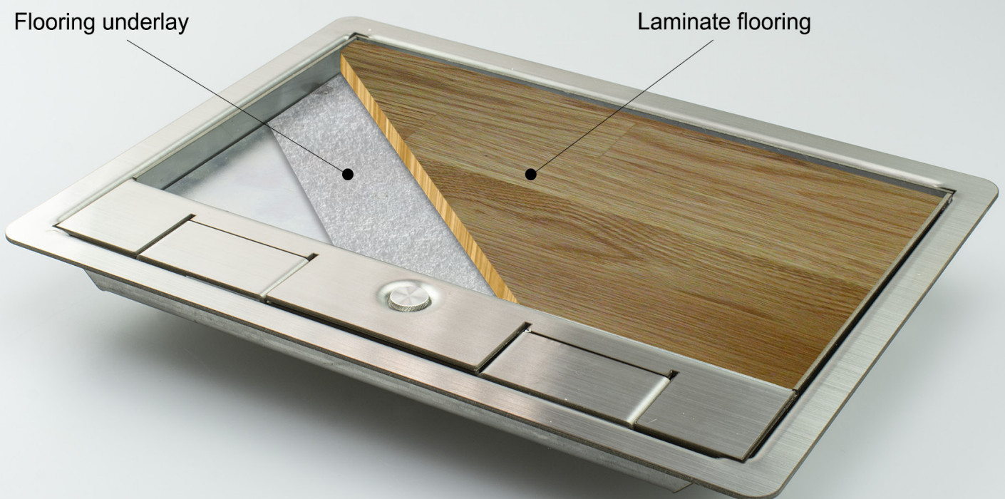
Illustration showing model: SSL12R281 (12mm Recessed Lid)