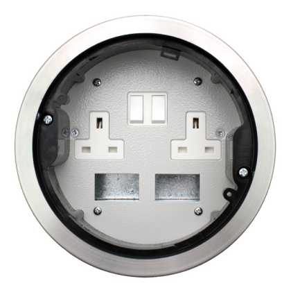
FGS169PDD 13A Twin Power Grommet + 2 Data Spaces