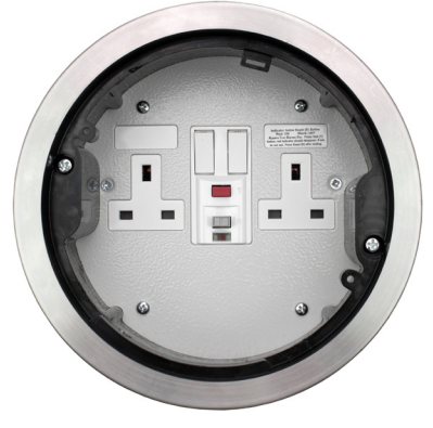
FGS169RCD RCD Protected Twin Power Grommet