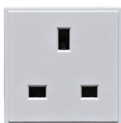
MMO10WH 13A Standard Socket Module To be used in conjunction with STO279