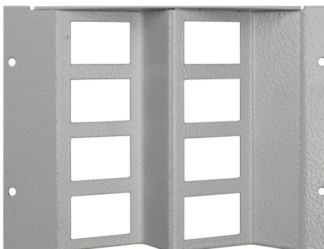
STO285/W2 [3] Dual 4 x LJ6C Data Wave Plate