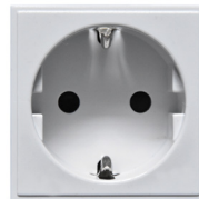
MMO20WH 16A Euro Socket Module To be used in conjunction with STO279