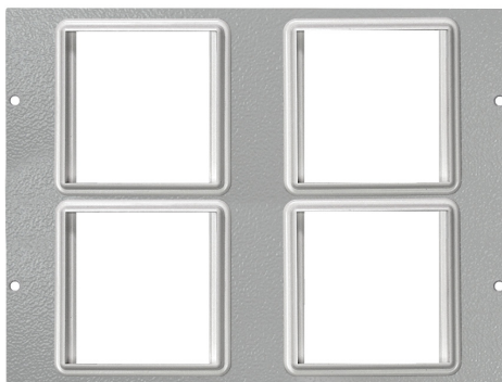
STO279/2 [1][3] Dual 2 x 50mm Euro Module Plate