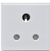
MMO38WH 5A Socket Module To be used in conjunction with STO279