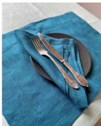
Ocean blue napkin Linen 185g Article: NOB185