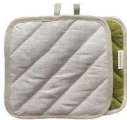
Double-sided potholder Flax/Hunting green Article: PHF/HG