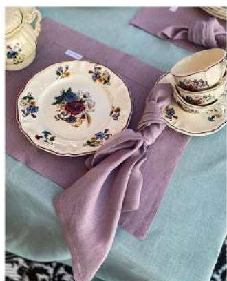
Lilac napkin Linen 155g Article: NL155