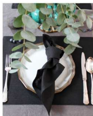
Black napkin Linen 250g Article: NBL250