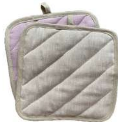
Double-sided potholder Flax/Lilac Article: PHF/L