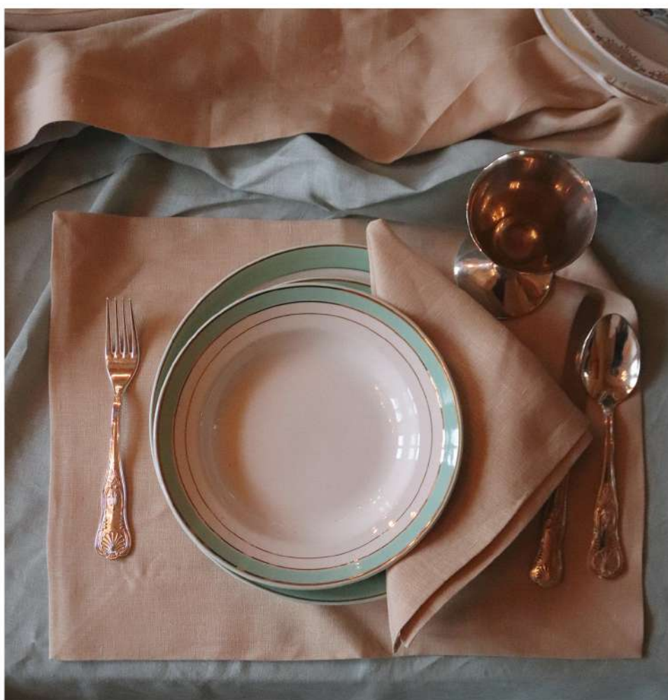
Beige placemat Linen 155g Article: PB155