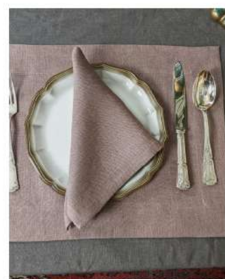
Taupe placemat Linen 185g Article: PT185