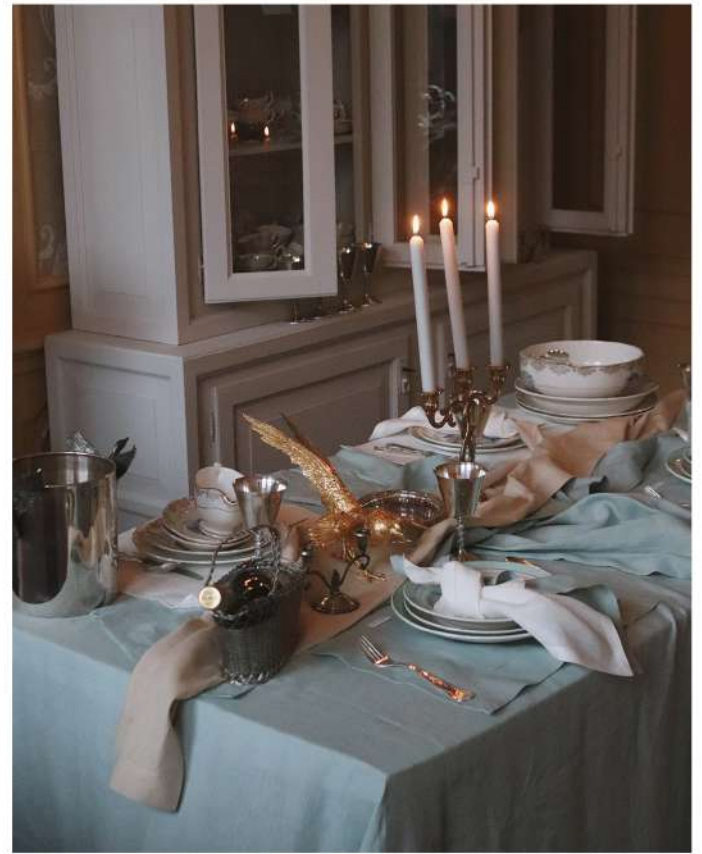
Turquoise tablecloth Linen 185g