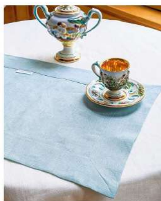
Turquoise placemat Linen 155g Article: PTQ155