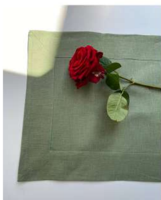
Olive placemat Linen 185g Article: PO185