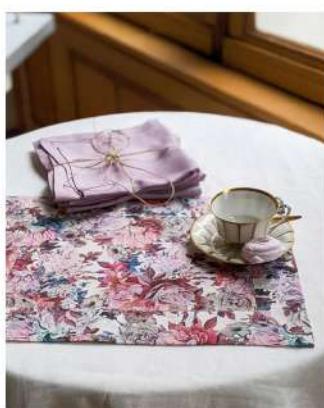
Peonies placemat Linen 185g Article: PP185