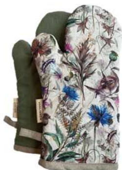
Double-sided mitten Olive/Garden Article: MO/GA