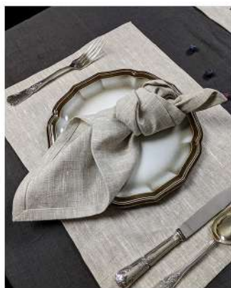
Thick flax napkin Linen 285g Article: NTF285