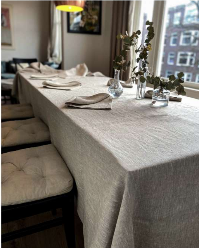
Flax tablecloth Linen 185g