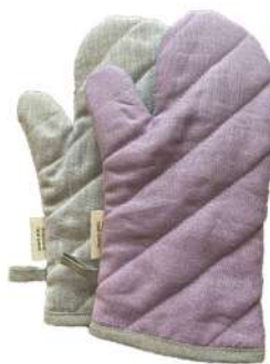
Double-sided mitten Flax/Lilac Article: MF/L