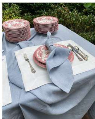
Dusty blue napkin Linen 155g Article: NDB155