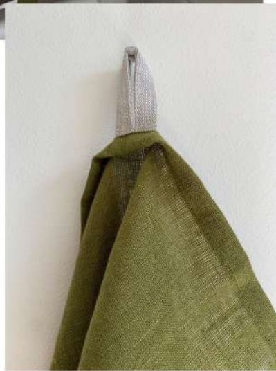
Kitchen towel Hunting green colour Article: KTHG