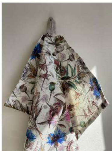
Kitchen towel Garden colour Article: KTGA