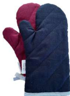
Double-sided mitten Burgundy/Black Article: MBU/BL