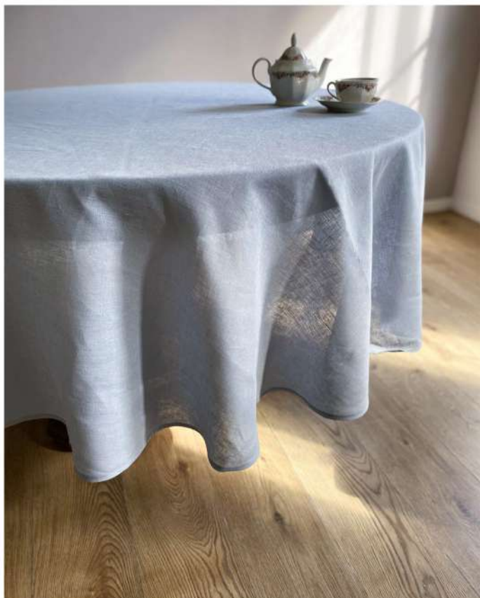
Dusty blue tablecloth Linen 155g