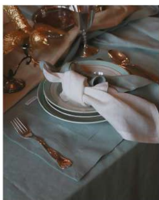
White napkin Linen 145g Article: NW145