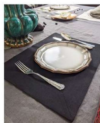
Black placemat Linen 250g Article: PB250