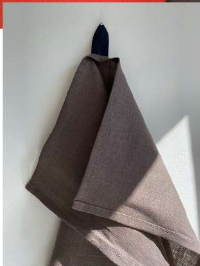
Kitchen towel Cocoa colour Article: KTC

Delivery time: 4-20 days Depends if we have it in stock or we have to produce it (As we mainly produce on demand)