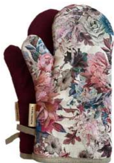
Double-sided mitten Burgundy/Peonies Article: MBU/P