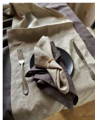
Safari napkin Linen 155g Article: NS155