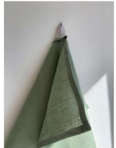
Kitchen towel Olive colour Article: KTO