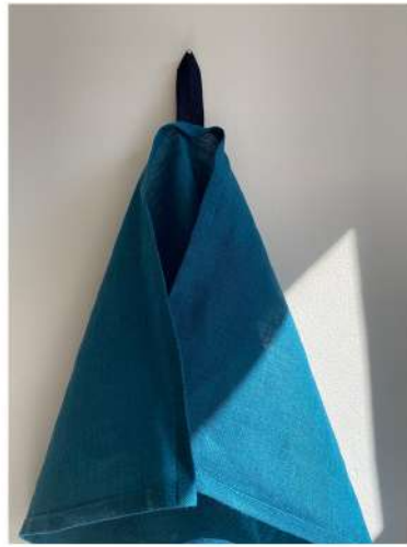
Kitchen towel Ocean blue colour Article: KTOB