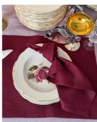
Burgundy napkin Linen 250g Article: NBU250