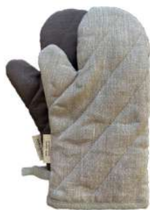
Double-sided mitten Flax/Graphite Article: MF/GR