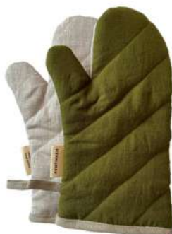
Double-sided mitten Flax/Hunting green Article: MF/HG