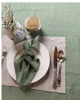
Olive napkin Linen 185g Article: NO185