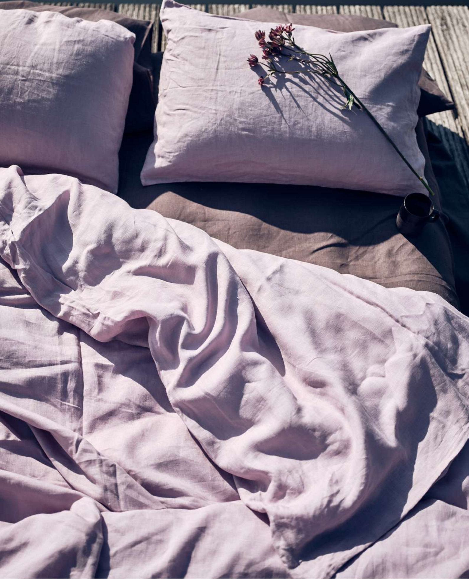
Lilac bedding colour