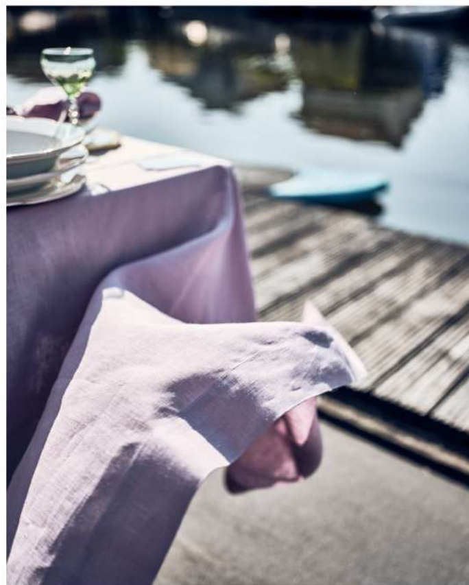
Lilac tablecloth Linen 155g