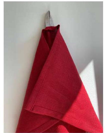
Kitchen towel Scarlet red colour Article: KTSR