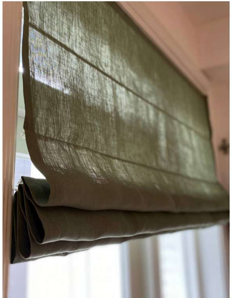
Olive linen roman blinds