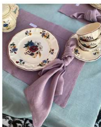
Lilac placemat Linen 155g Article: PL155