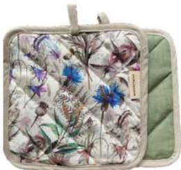
Double-sided potholder Olive/Garden Article: PHO/GA