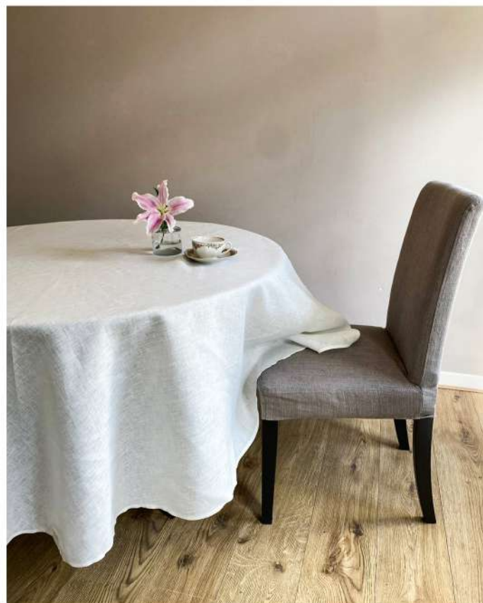
White tablecloth Linen 145g