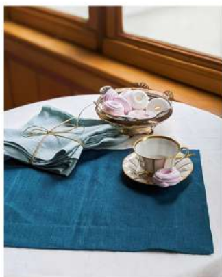
Ocean blue placemat Linen 185g Article: POB185