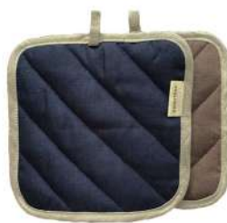
Double-sided potholder Cocoa/Dark night Article: PHC/DN