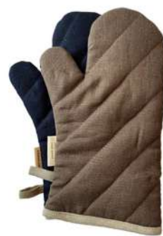
Double-sided mitten Cocoa/Dark night Article: MC/DN