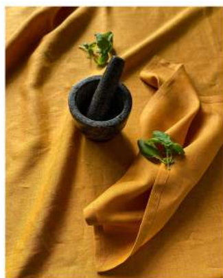
Saffran napkin Linen 185g Article: NSF185