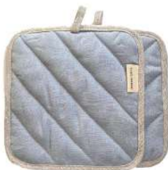
One colour potholder Dusty blue Article: PHDB