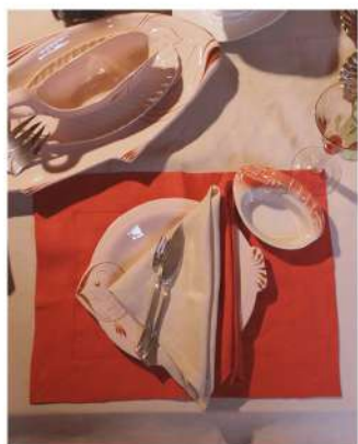
Terracotta placemat Linen 185g Article: PTR185