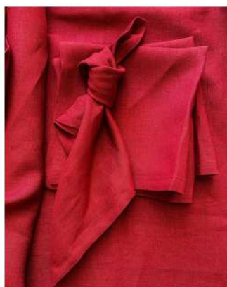
Scarlet red napkin Linen 185g Article: NSR185