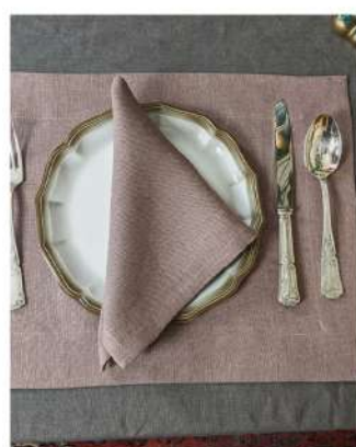
Taupe napkin Linen 185g Article: NT185