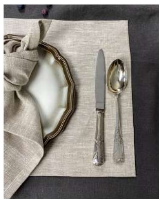
Thick Flax placemat Linen 285g Article: PTF285