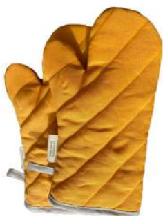
One colour mitten Safari Article: MSF