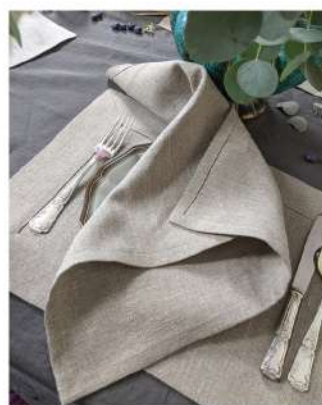
Rough flax napkin Linen 345g Article: NRF345