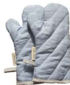
One colour mitten Dusty blue Article: MDB