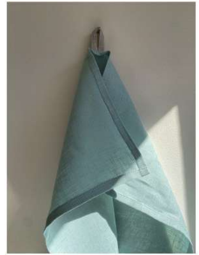
Kitchen towel Turquoise colour Article: KTTQ