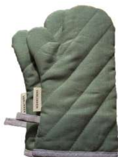
One colour mitten Olive Article: MO