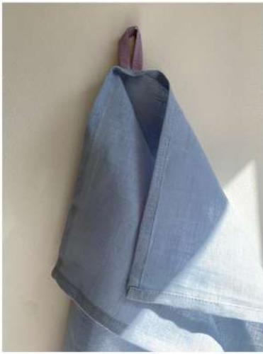
Kitchen towel Dusty blue colour Article: KTDB