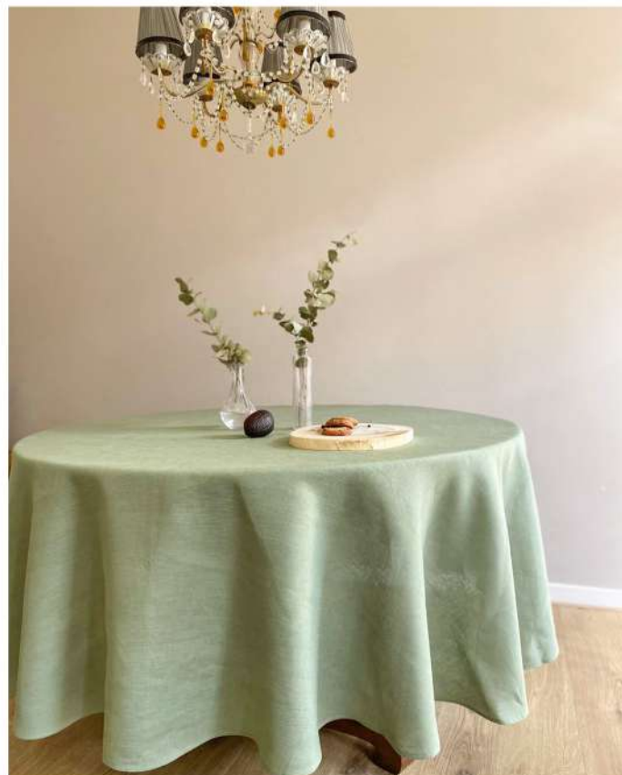
Olive tablecloth Linen 185g