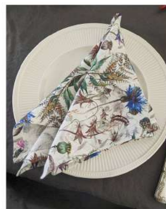
Garden napkin Linen 185g Article: NGA185