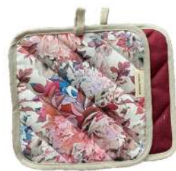
Double-sided potholder Burgundy/Peonies Article: PHBU/P