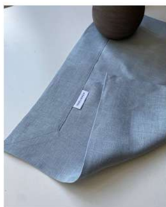
Dusty blue placemat Linen 155g Article: PDB155