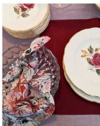
Peonies napkin Linen 185g Article: NP185