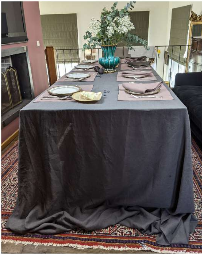
Graphite tablecloth Linen 185g