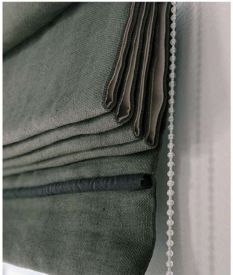
Dark khaki linen roman blinds with blackout