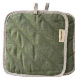
One colour potholder Olive Article: PHO