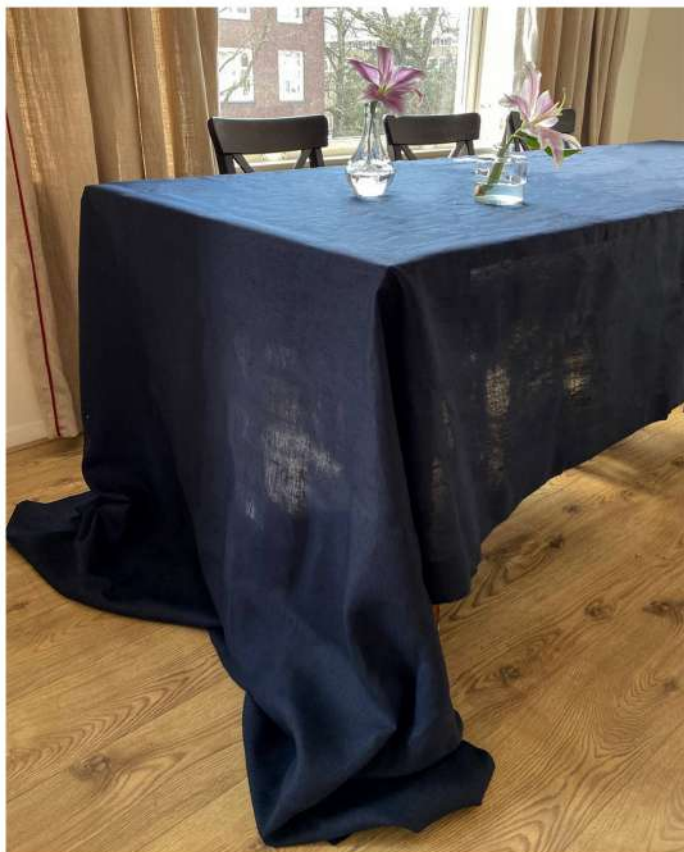
Dark night tablecloth Linen 185g