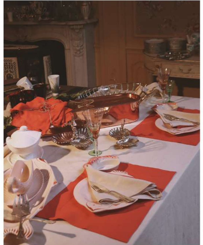
Beige tablecloth Linen 155g