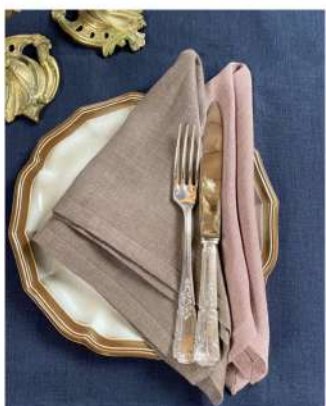
Cocoa napkin Linen 185g Article: NC185