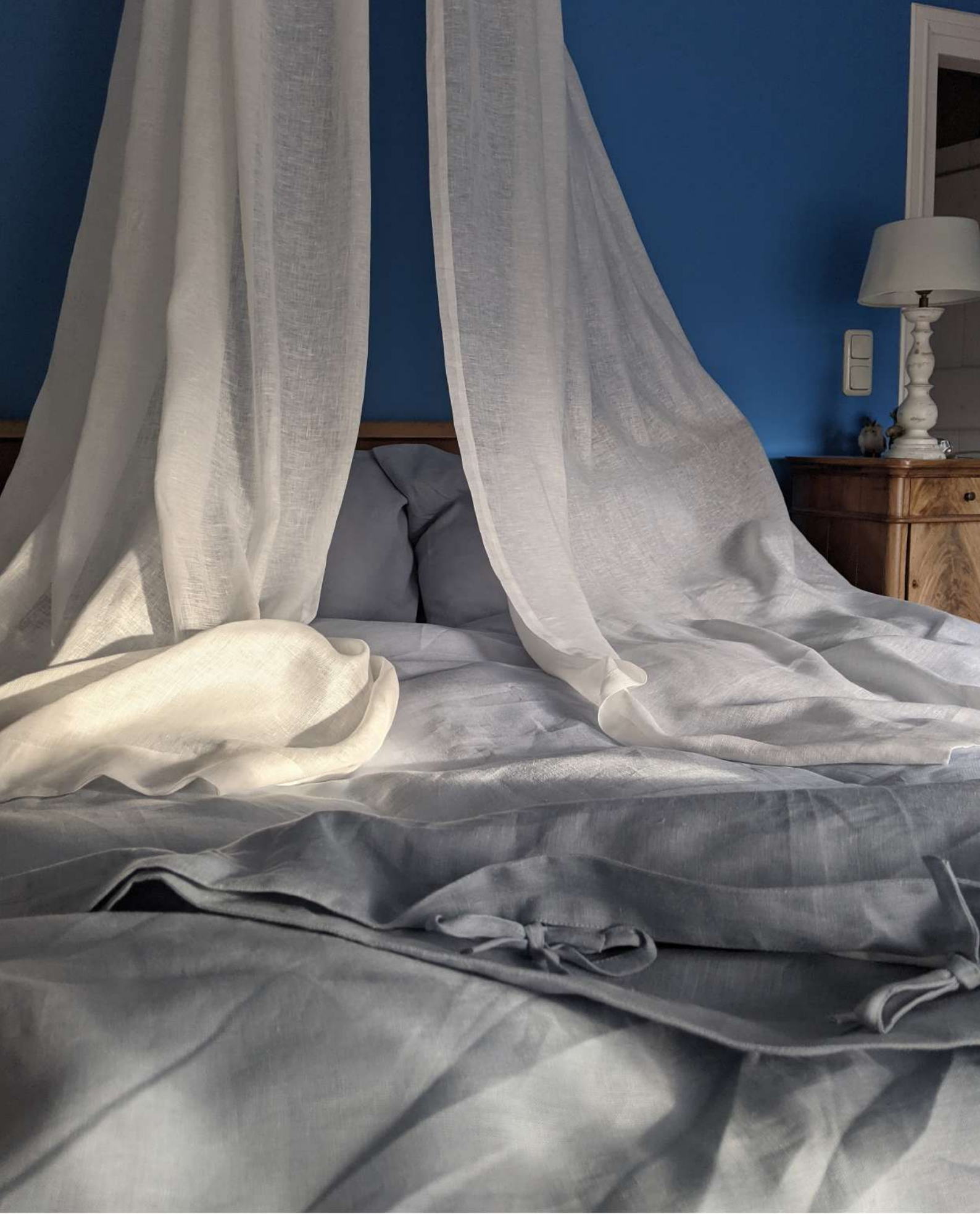
Dusty blue colour