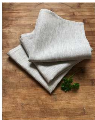
Flax napkin Linen 185g Article: NF185