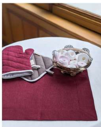
Burgundy placemat Linen 250g Article: PB250