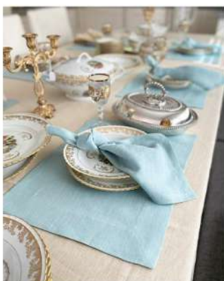
Turquoise napkin Linen 155g Article: NTQ155