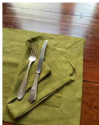
Hunting green napkin Linen 185g Article: NHG185