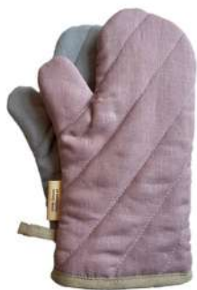
Double-sided mitten Dusty blue/Lilac Article: MDB/L