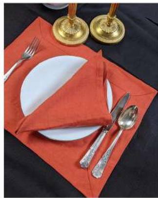
Terracotta napkin Linen 185g Article: NTR185