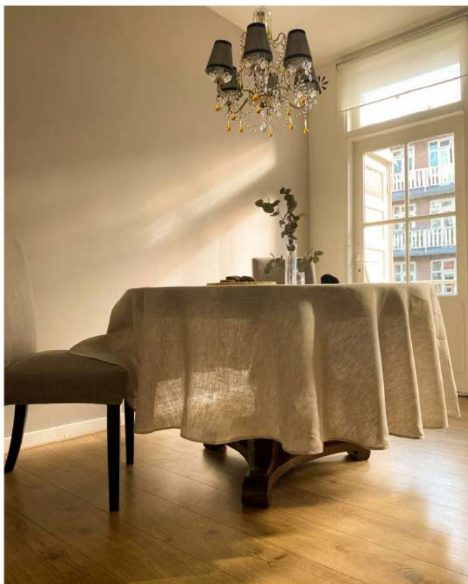
Flax tablecloth Linen 185g