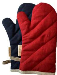
Double-sided mitten Dark night/Scarlet red Article: MDN/SR