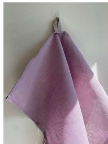
Kitchen towel Lilac colour Article: KTL