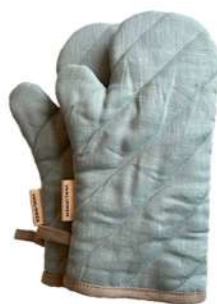
One colour mitten Turquoise Article: MTQ