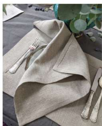
Rough flax placemat Linen 345g Article: PRF345