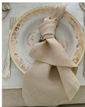
Beige napkin Linen 155g Article: NB155