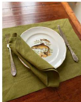
Hunting green placemat Linen 185g Article: PHG185