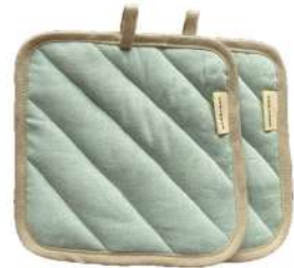
One colour potholder Turquoise Article: PHTQ