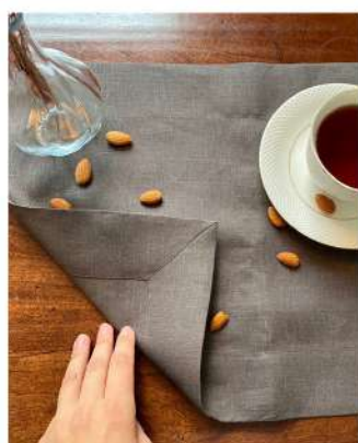
Graphite placemat Linen 185g Article: PG185