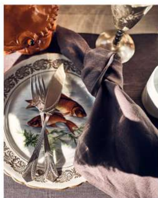
Graphite napkin Linen 185g Article: NGR185