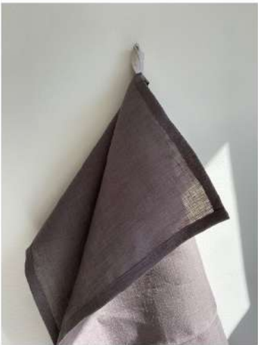
Kitchen towel Graphite colour Article: KTGR