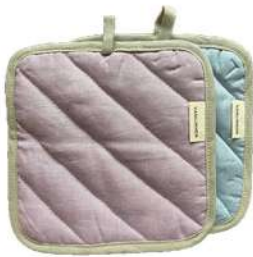
Double-sided potholder Dusty blue/Lilac Article: PHDB/L