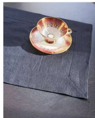
Dark night placemat Linen 185g Article: PDN185