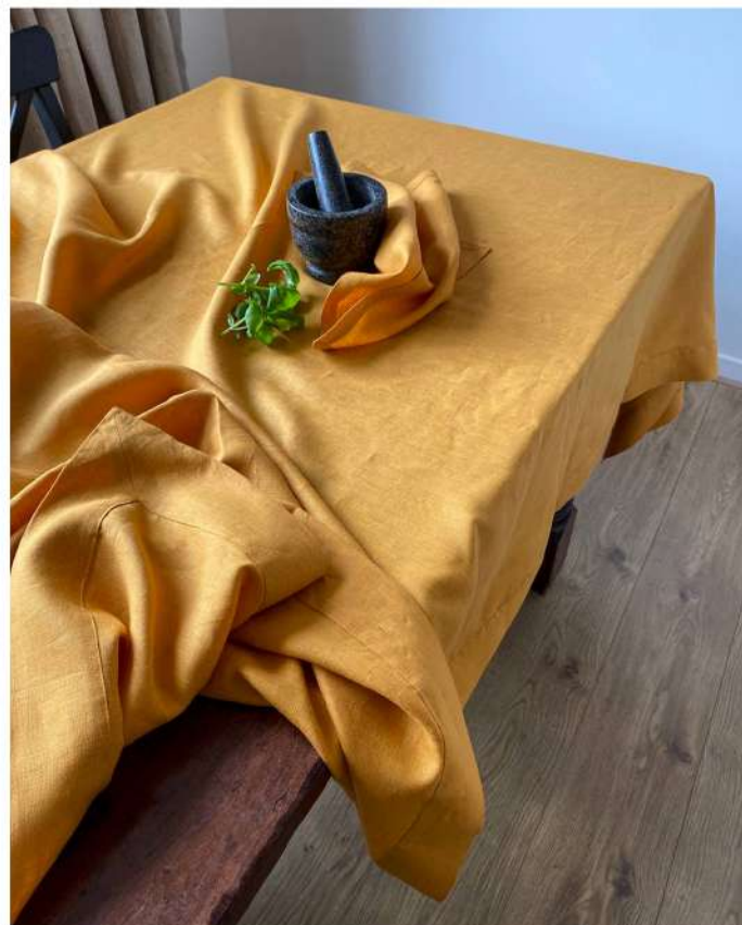
Safran tablecloth Linen 185g