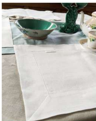
White placemat Linen 145g Article: PW145