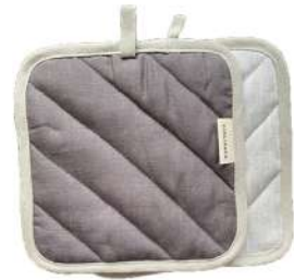
Double-sided potholder Graphite/Flax Article: PHGR/F