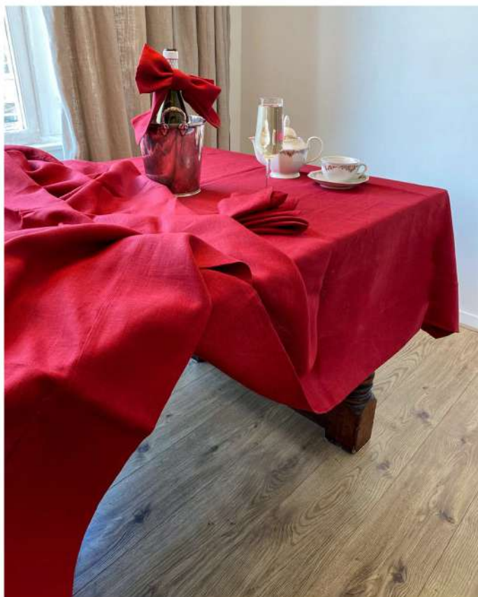
Scarlet red tablecloth Linen 185g