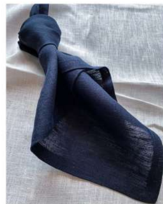
Dark night napkin Linen 185g Article: NDN185