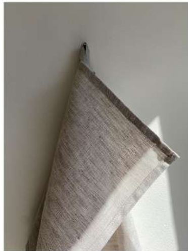
Kitchen towel Flax colour Article: KTF