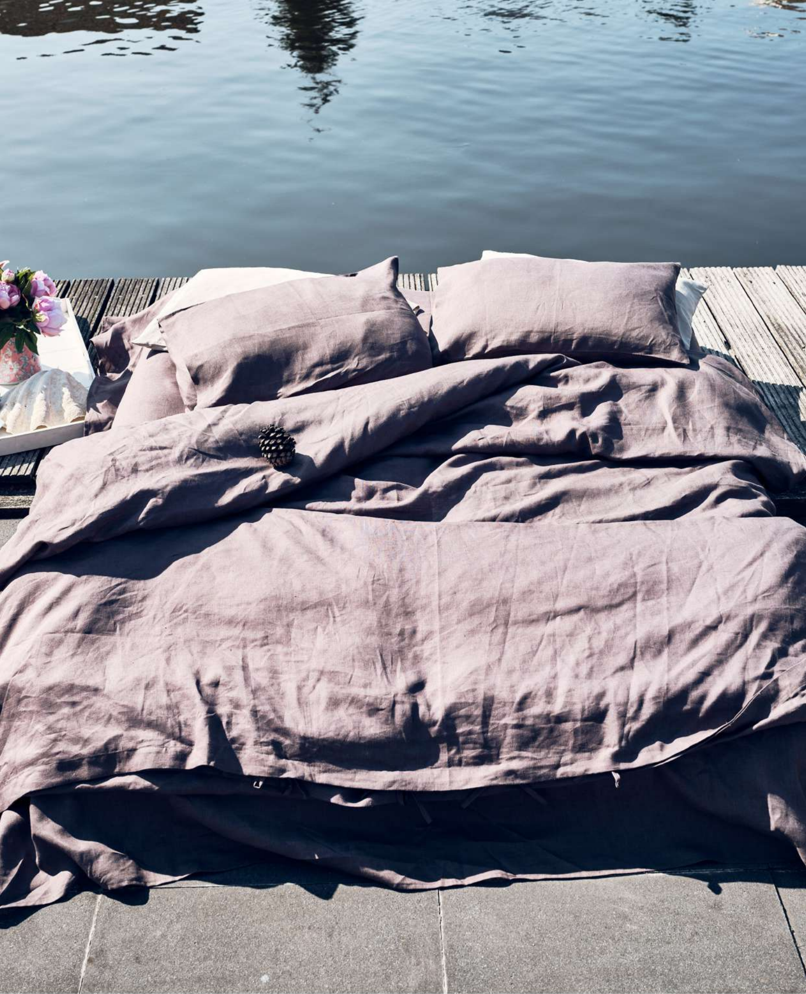
Graphite bedding colour