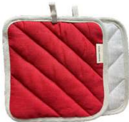
Double-sided potholder Scarlet red/Flax Article: PHSR/F