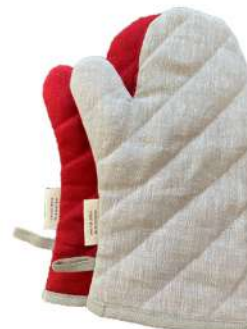
Double-sided mitten Burgundy/Peonies Article: MSR/F