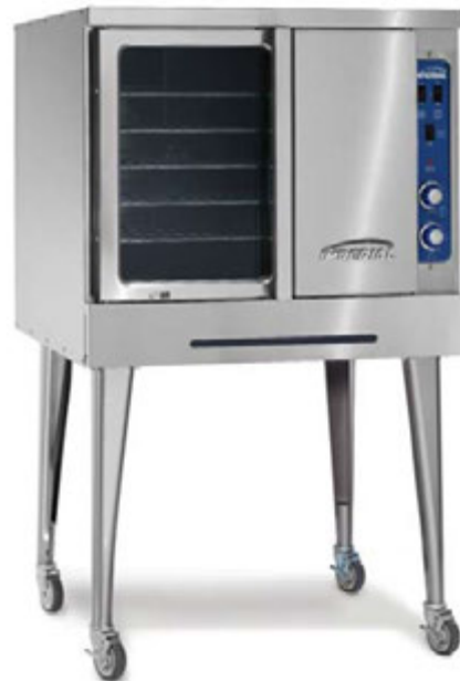
ICV-1 shown with optional casters

Four bearings per door extend the life of the door mechanism.