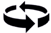
Rotary Base Stone