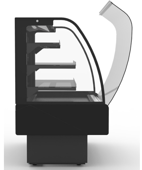
TILT OUT FRONT GLASS