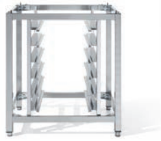
AX-C10ST OVEN STAND