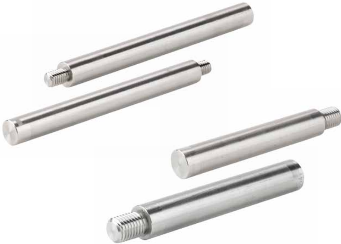
FIG. 245 THREADED SUPPORT ROD