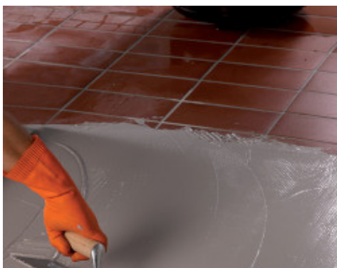
Applying a second layer of Monolastic on Mapenet 150