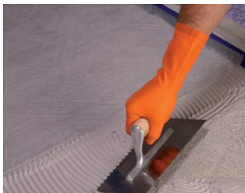
Applying a first layer of Monolastic welded with Mapetex Sel N on a new screed

mixed with Fugolastic or Ultracolor Plus ) or epoxy grout, class RG ( Kerapoxy ). Seal expansion joints with a special MAPEI sealant ( Mapesil AC , Mapesil LM or Mapeflex PU45 FT ).