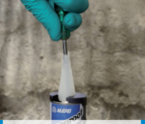
Piercing the protective membrane on the Mapeproof Swell tube