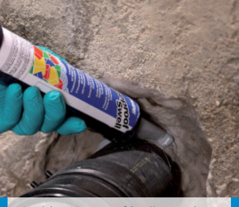
Applying Mapeproof Swell around a pipe