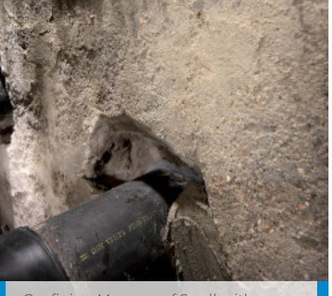
Confining Mapeproof Swell with a product of the Mapegrout line