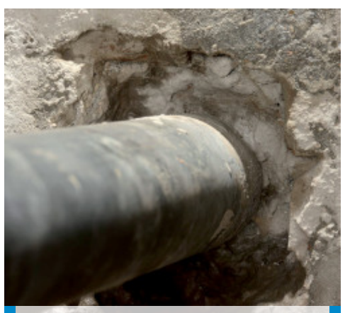
Breaking out structure around a pipe

If cracked concrete requires sealing, break out the sides of the cracks or construction joint using suitable mechanical means, to a depth of at least 6 cm. After removing all dust and rubble, apply Mapeproof Swell and then limit its boundaries using a suitable product from the Mapegrout line. If water is seeping through, block the flow using Lamposilex and then apply Mapeproof Swell on both sides, making sure that the boundary formed is at least 5 cm. Mapeproof Swell is available in cartridges containing 320 ml of the product. To apply Mapeproof Swell , cut off the tip of the nozzle according to the size of bead required, and pierce the membrane under the nozzle. Insert the cartridge in an extrusion gun and apply the product directly onto the concrete or element to be sealed.