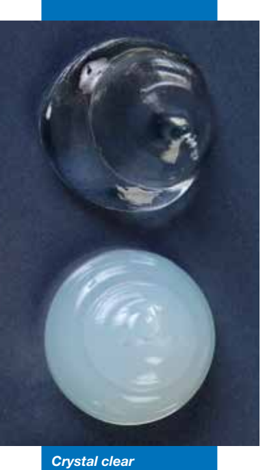
transparency of Mapeflex MS Crystal vs. opaque transparency of traditional silicone