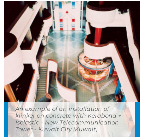
An example of an installation of klinker on concrete with Kerabond + Isolastic - New Telecommunication Tower - Kuwait City (Kuwait)