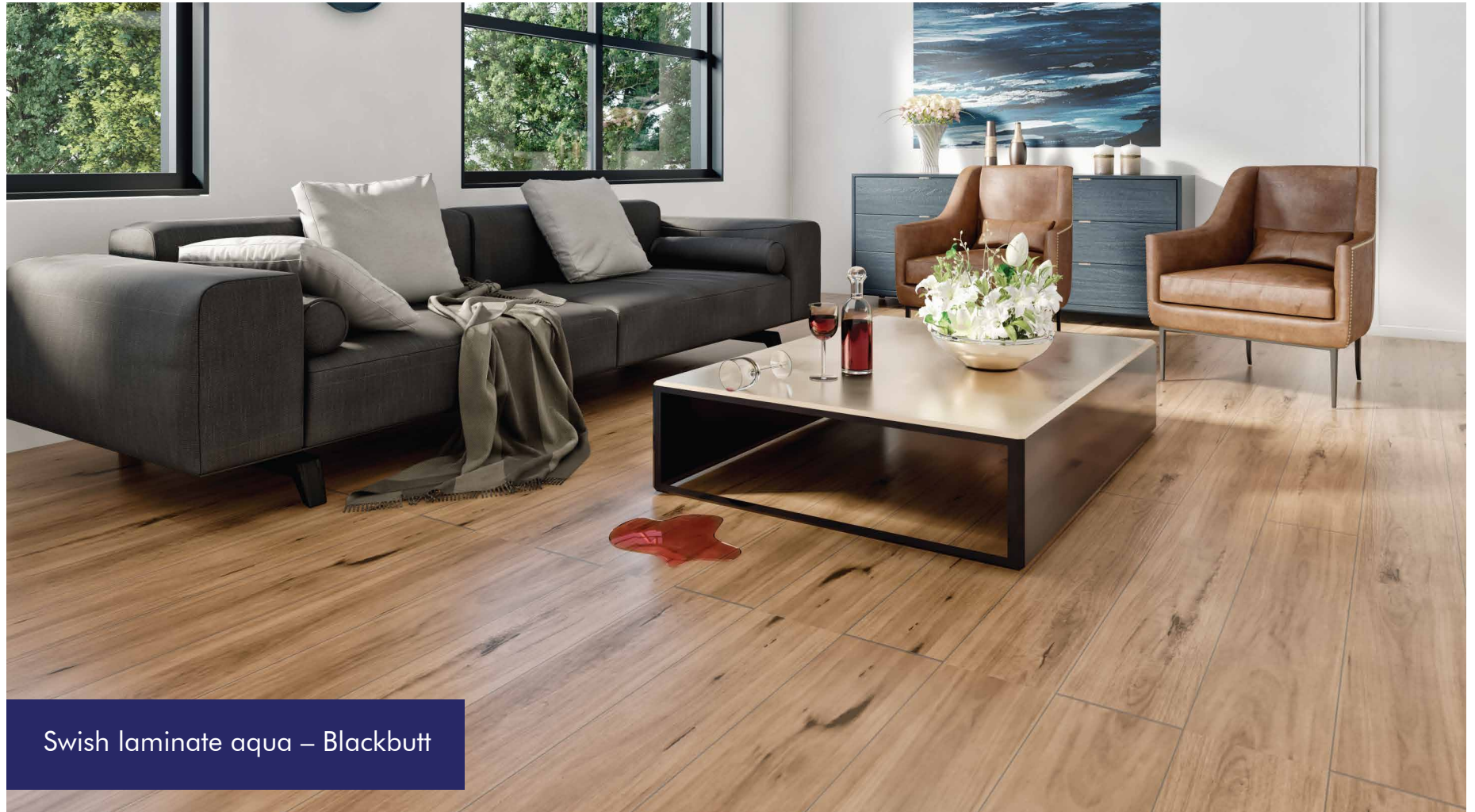
Swish laminate aqua – Blackbutt