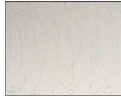
COVERAGE TOO LIGHT