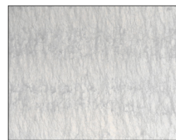
CORRECT APPLICATION = 20 dry gms/sqm