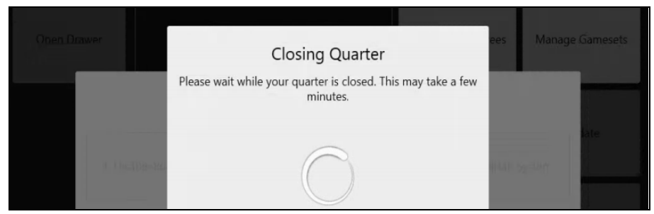
NOTE: It can take a few minutes for the quarter out to process. Do not restart the POS or close the dialog box until it is complete.