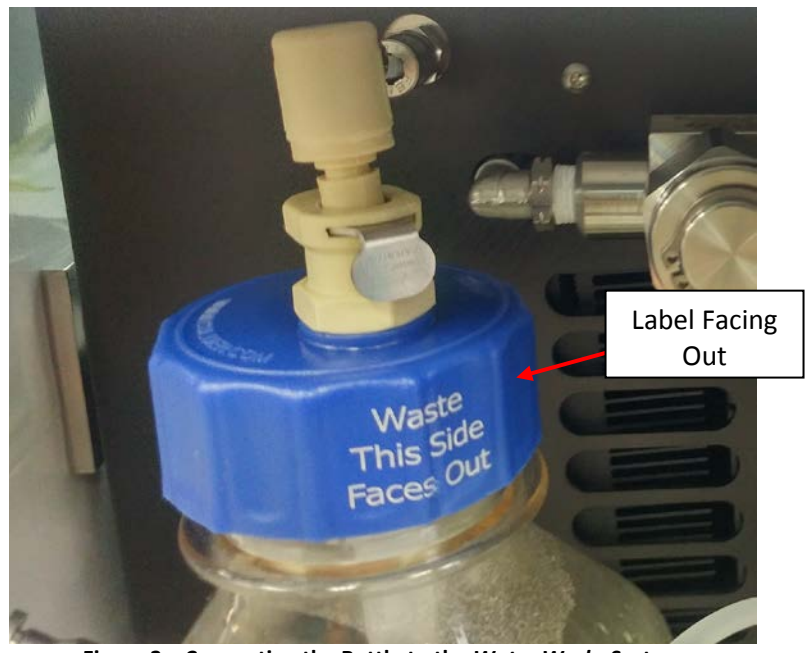
Figure 3 – Connecting the Bottle to the Water Works System

6. Reconnect the bottle by pressing the Quick Disconnect Insert into the coupling on the Quick Disconnect Cap until it clicks into place.