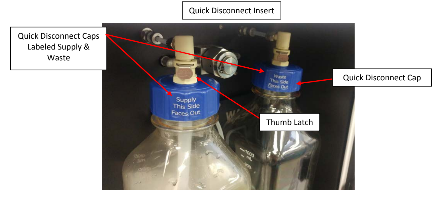
Figure 1 – Quick Disconnect Components

1. Disconnect the bottle by pressing the thumb latch on the Quick Disconnect Cap. See Figure 1.