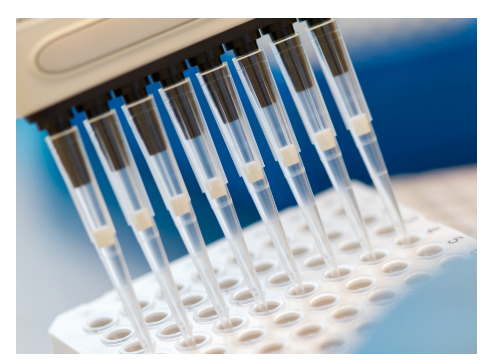
Clean & reuse your filtered pipette tips

(1) https://cen.acs.org/environment/pollution/pervasiveness-microplastics/97/i5# (2) https://www.sciencedirect.com/science/article/pii/S0160412022001258 (3) https://www.sciencedirect.com/science/article/pii/S0160412020322297 (4) https://www.mdpi.com/2073-4360/14/13/2700