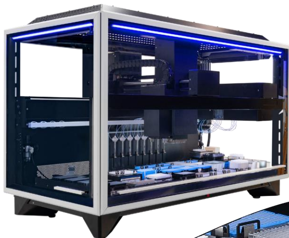
Fontus liquid handling workstation YFL8H02 / YFL8L02

For research use only. Not for use in diagnostic procedures.