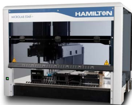
HAMILTON Genomic STARlet Fully automated workflows to quickly isolate high-quality nucleic acids

In this application note we demonstrate the utility and advantages of the automated NucleoMag ® Pathogen extraction workflow from clinical samples on one of Hamilton's most popular workstations.