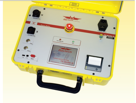
TR-Mark III 250V

Extended test voltage measurement range of up to 250V Automatic measurements of voltage, turns ratio, current, and phase displacement Easy one-time hook up to the transformer Automatic test voltage range Displays deviation from a nominal ratio Tap changer interface with graphic results Load on test object <0.05 VA Measures power transformers, PTs and CTs Automatic vector group detection Enhanced heavy-duty protection circuitry Emergency stop button immediately turns off output Internal printer Data storage of over 10,000 measurements Simple to operate color LCD touch screen with back light Two USB interfaces 5-Year standard warranty