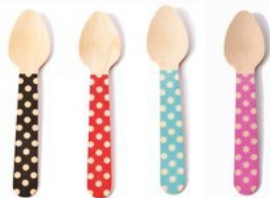
Colorful Wooden Demitasse Spoons by Simply Baked www.simplybaked.us

MSRP: Rise $39.95; Tour $44.95; Lift $49.95; Rush $39.95