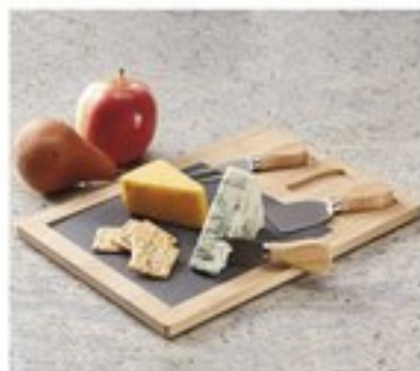
Say Cheese! Collection by Design Imports www.designimports.com

The new Say Cheese! collection from Design Imports includes everything serving fine cheese including bamboo appetizer board sets, stainless steel knives, slate cutting boards, coordinating printed dishtowels, and a slate cheese board and marker set to customize your cheese selection.