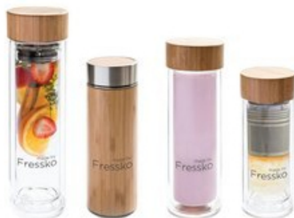
Brew as You Go by Fressko www.madebyfressko.com

Based in Melbourne, Australia, the Brew as You Go line of chemical-free flasks from Fressko come in a variety of sizes and stylish materials. Rise (300 ml), Tour (400 ml), and Lift (500 ml) are made from Class A borosilicate glass, are double walled, BPA free and come with a two-in-one infuser and a leak proof bamboo lid. They are suitable for both hot and cold beverages and will keep drinks hot for up to four hours. Rush (10 ounces) is made of bamboo with a stainless steel interior and stays hot for up to six hours, dependent on use.