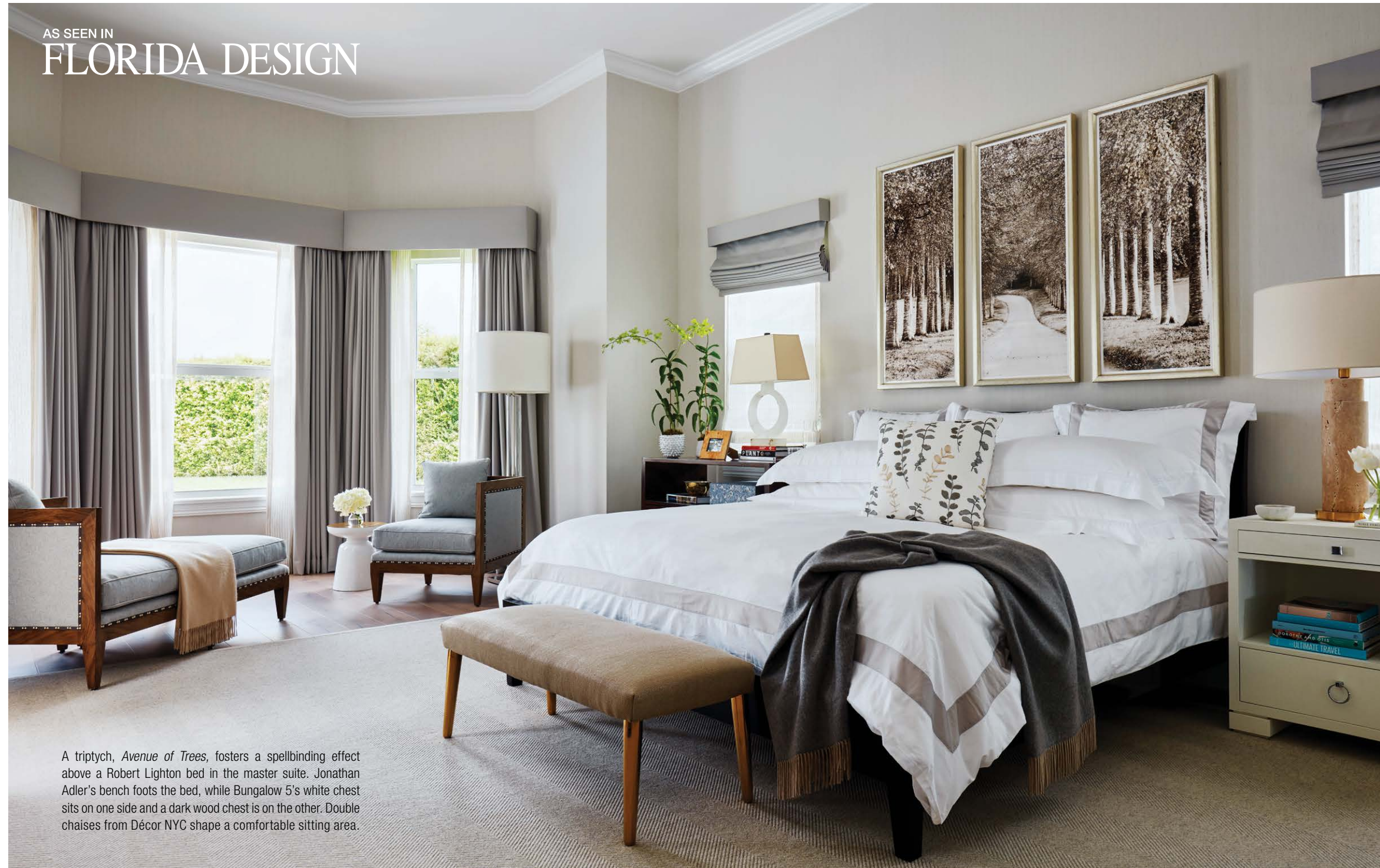
A triptych, Avenue of Trees , fosters a spellbinding effect above a Robert Lighton bed in the master suite. Jonathan Adler's bench foots the bed, while Bungalow 5's white chest sits on one side and a dark wood chest is on the other. Double chaises from Décor NYC shape a comfortable sitting area.

Warm hues wrap the master bedroom, where an unexpected color palette is interpreted with soft grays and beiges, classic lines and pale woods. An intimate sitting area is set with plush chaises that seem to dream in twilight. "We like to take a historical shape, like these chairs, and update it," Cox says, "or mismatch bedside tables so that nothing becomes static or uninteresting." Nearby, striated stone wraps the master bath that provides spa-like rejuvenation with a double shower fronted by a backdrop wall for the deep-soaking tub.