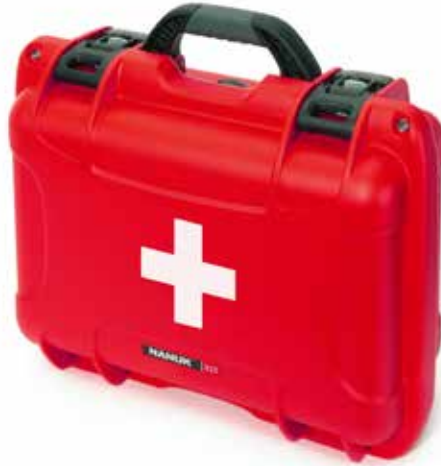
915 First Aid Cases

Interior dimensions L13.8" × W9.3" × H6.2" L351mm × W236mm × H157mm