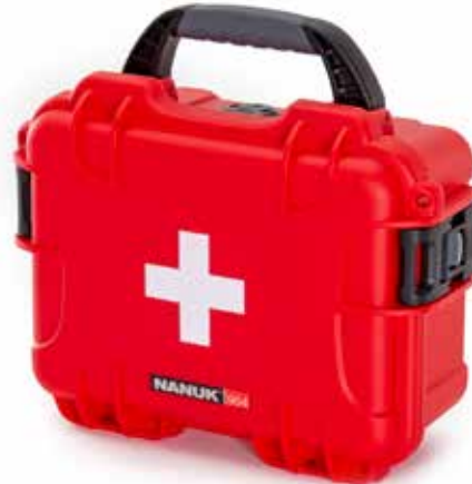
904 First Aid Cases

Exterior dimensions L9.1" × W6.8" × H3.8" L231mm × W173mm × H97mm