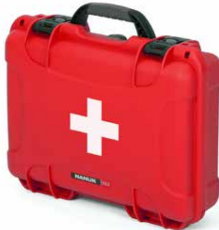
910 First Aid Cases

Exterior dimensions L12.6" × W9.0" × H4.4" L321mm × W229mm × H111mm