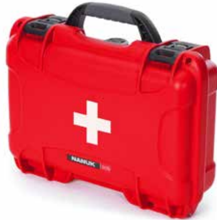
909 First Aid Cases

Interior dimensions L11.4" × W7.0" × H3.7" L291mm × W178mm × H93mm