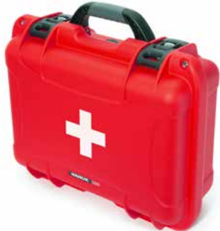
920 First Aid Cases

Exterior dimensions L15.4" × W12.1" × H6.8" L391mm × W307mm × H173mm