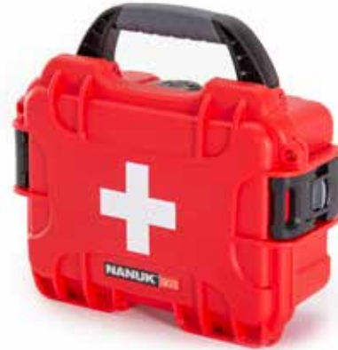
903 First Aid Cases

Interior dimensions L7.4" × W4.9" × H3.1" L188mm × W124mm × H79mm