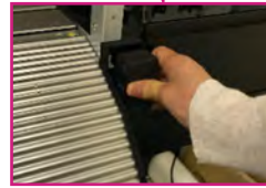
Multi-stage pressure mechanism