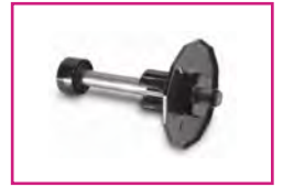
Media Flange for improved handling

MUTOH's genuine VerteLith RIP software bundled with FlexiDESIGNER MUTOH Edition 21 optimizes the XPJ-1682SR through these key features: