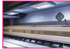
Internal LED Lighting