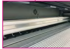
High precision aluminum rail mechanism