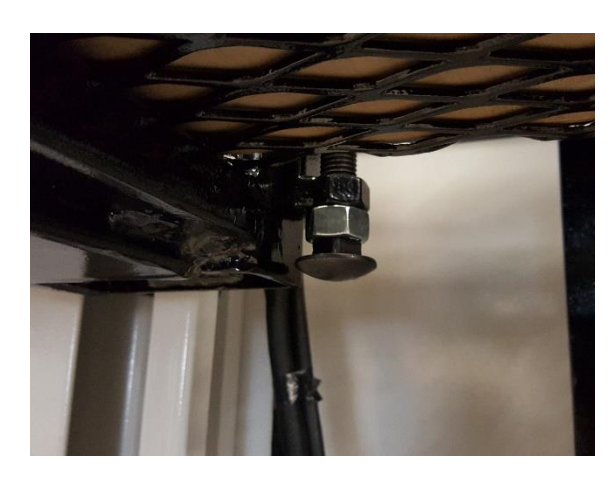
Figure 3, 4 5/8" carriage bolt – mechanical stop

2. Identify and locate mechanical stops – 5/8" carriage bolts – ref. figure 3,4