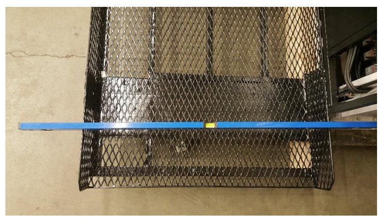
Figure 2 Page 1 of 6