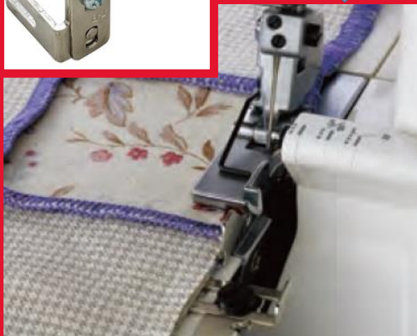
Cloth Guide + Attachment for 1200D Professional