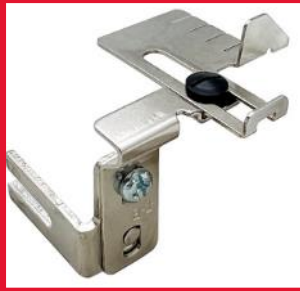
Cloth Guide for 4 Thread models