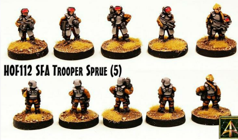
HOF112 SFA TROOPER SPRUE (5)