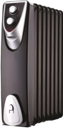
Main Body x1