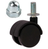
Castor Wheels with Nut x4