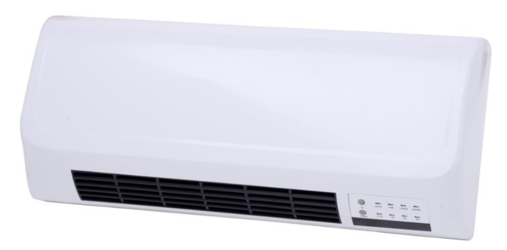
Main Unit x 1