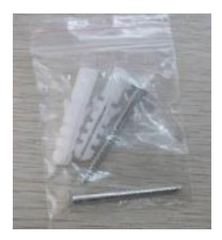
Screw Pack: Screws x 2, Wall plugs x 2