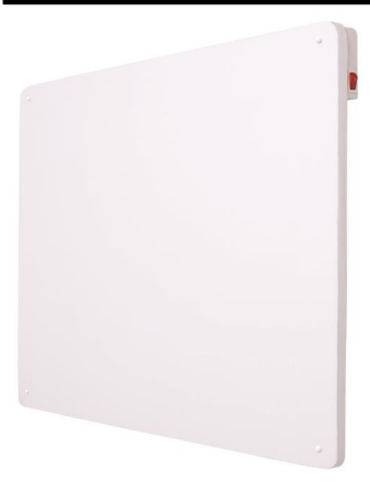
Heater x 1