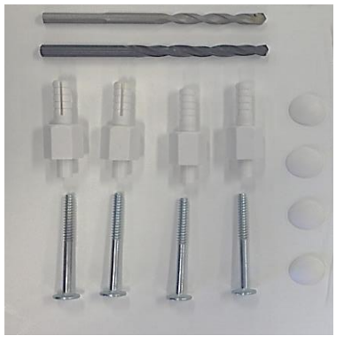
Screw pack components Drill bits x 2 (1 x 7mm for plasterboard or wooden walls, 1 x 8mm for masonry walls) Mounting Plugs x 4 Screws x 4 Screw Caps x 4