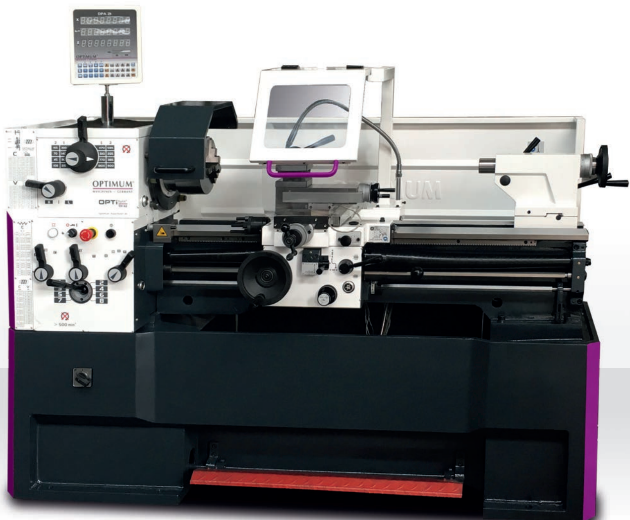
Fig.: TH 4210D - Shown with optional lathe chuck