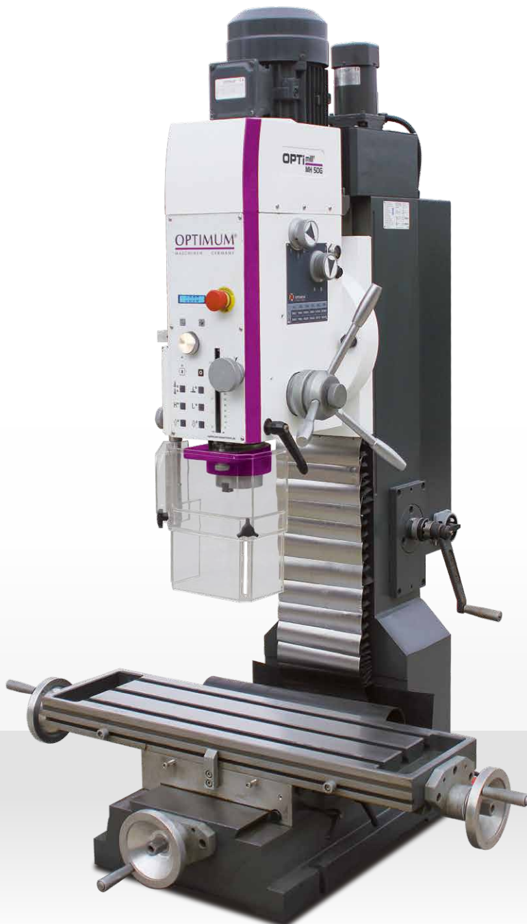
Fig.: MH 50V