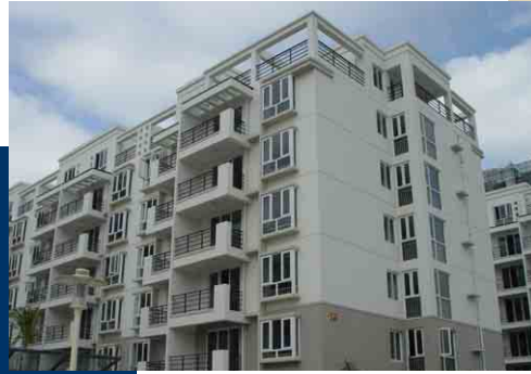
PREMIUM EXTERIOR 100% ACRYLIC