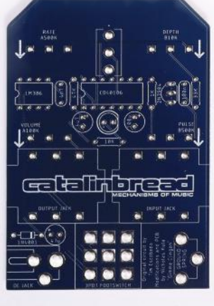
circuit board (1)