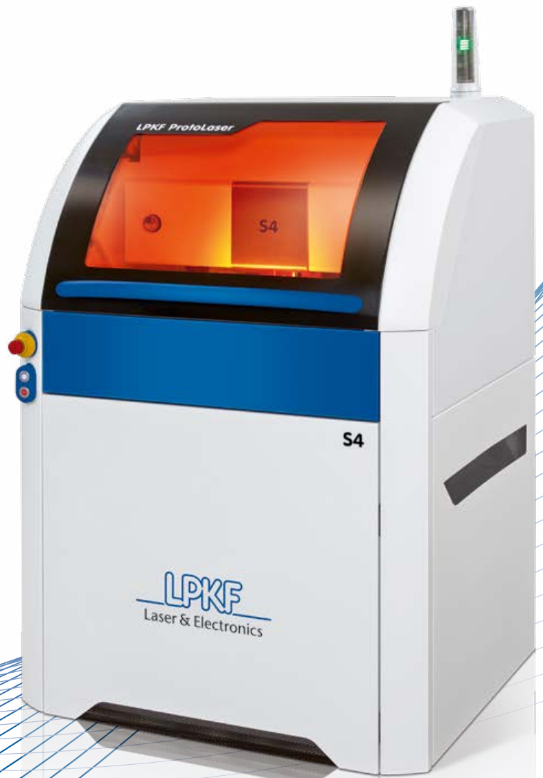
LPKF ProtoLaser S4: Specialist for PCB Prototyping